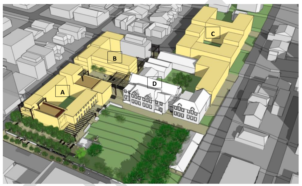
Figure 5: UDR Massing Model