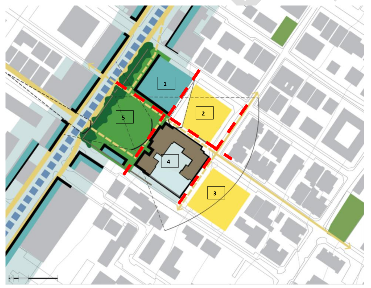
Figure 4: Consolidation and Sub-Division of the properties