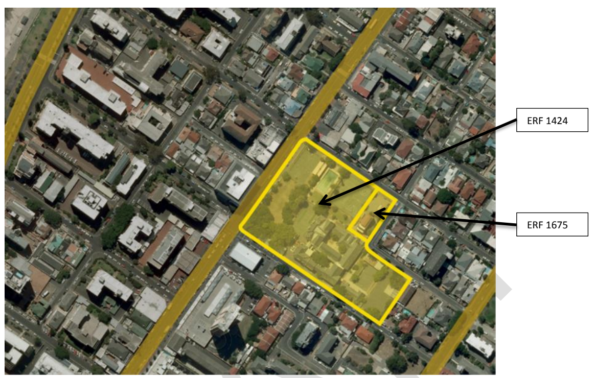
Figure 3: Erf Details