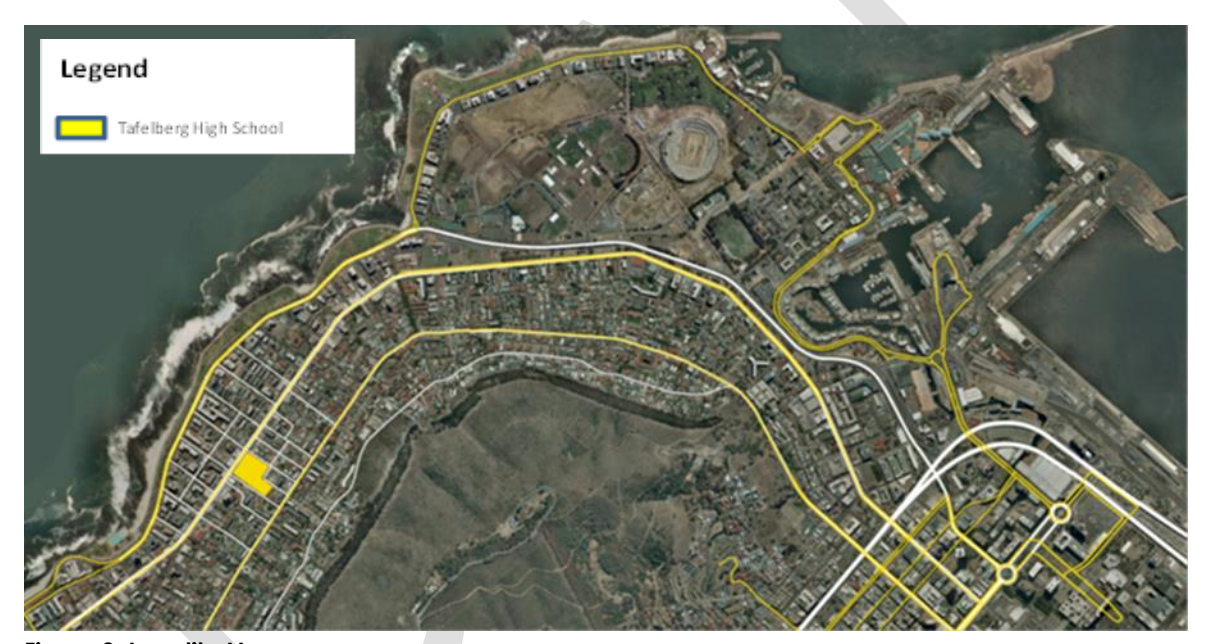
Figure 2: Locality Map