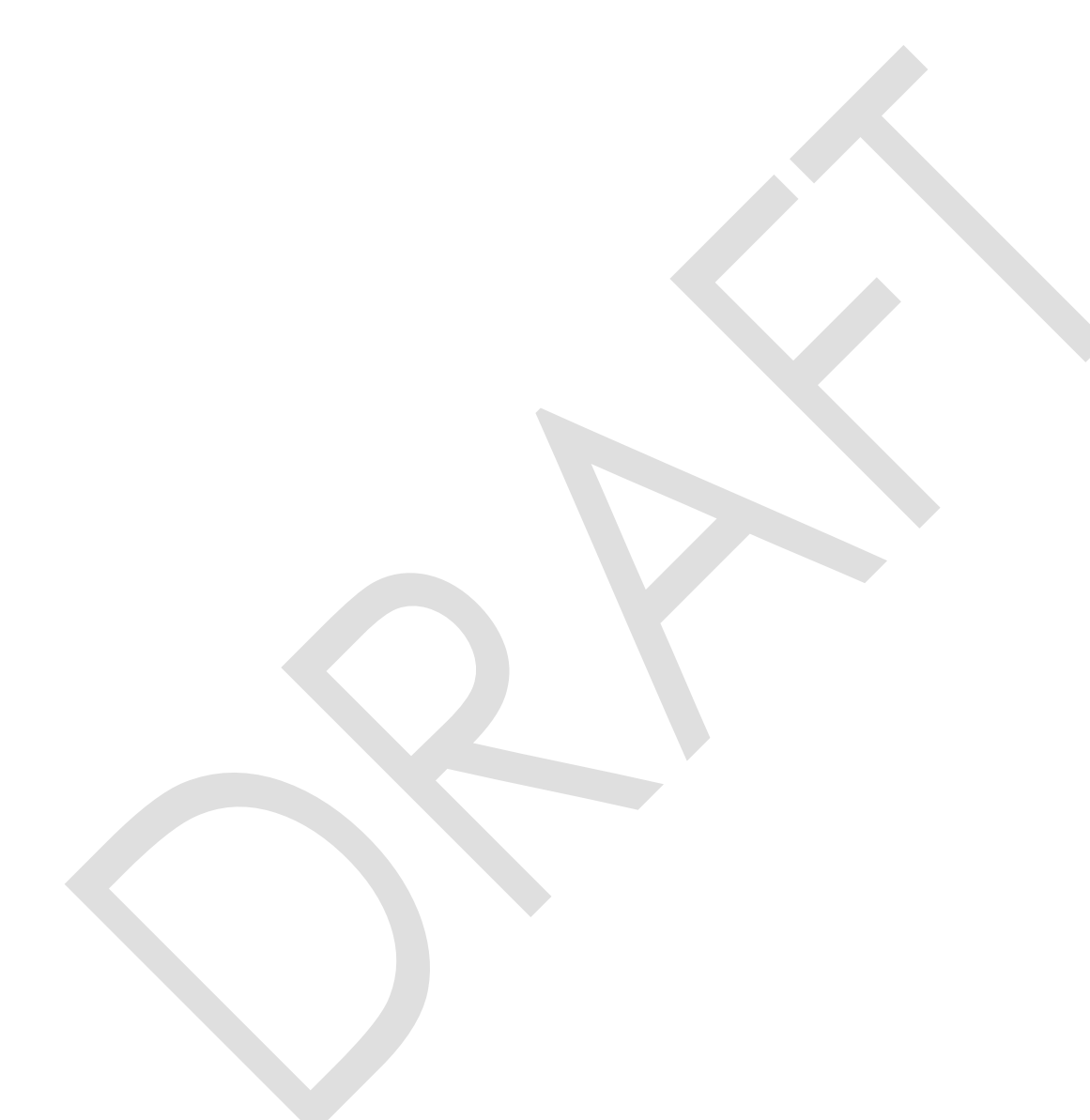
Table 3: SWOT Analysis Option 3